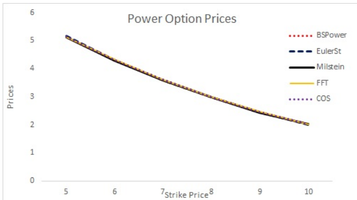
Figure 3: Power Option Prices via Analytical Solution, MCS-Euler, MCS-Milstein, FFT and COS.

Therefore, it shows that the COS method is more efficient in pricing power options than the rests of the option pricing techniques that we use in this study. Furthermore, using the MCS as the benchmark, the COS method produces accurate approximation of the power option prices because the percentage relative error is less than 1% for each of the prices corresponding to each strike price. This is shown in Table 6. Figure 3 plot the prices obtained using all the methods in this study.